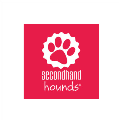
Secondhand Hounds $6,048.13 RECEIVED