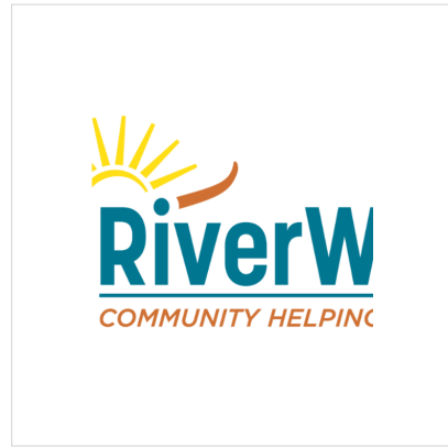
RiverWorks Community Development $1,620.44 RECEIVED